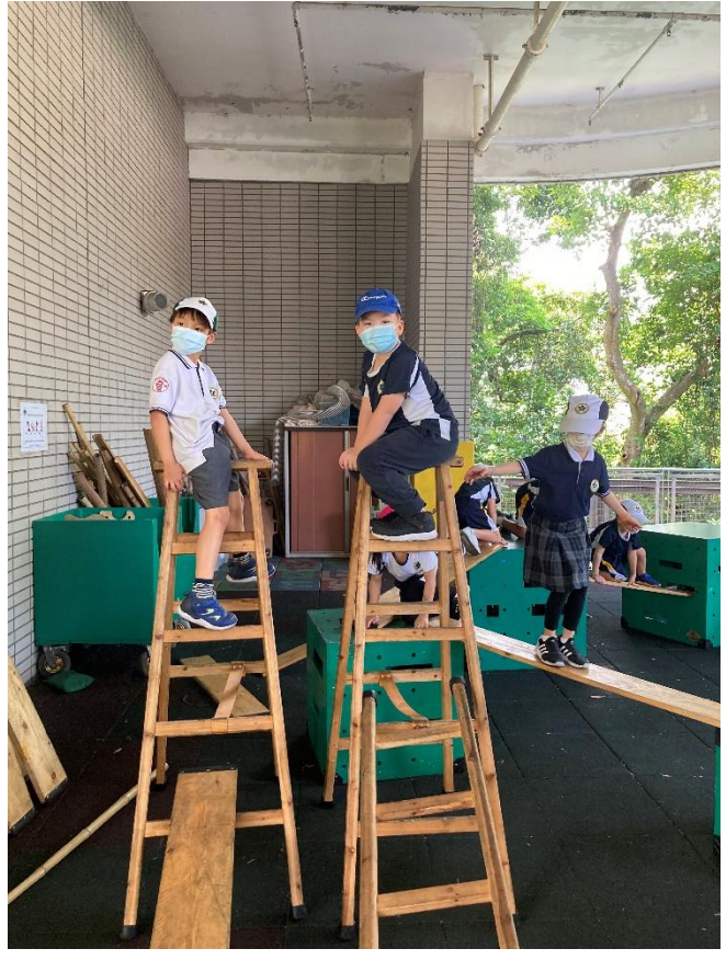
In P3 – P6 assembly this week we focused on Kindness as a value and looked in detail at the playground and how we can play together and support each other when we play. We also shared some inspirations from