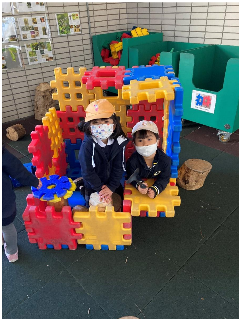
Engineers of the future in their perfectly designed house at recess today! Chairs, tables, roof shade – the whole lot included.